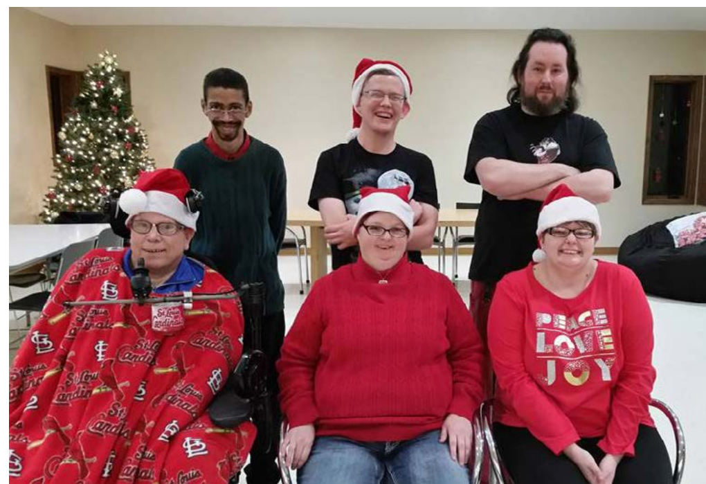
People First of Missouri

Photo below: Newly elected officers of People First of Pike County.