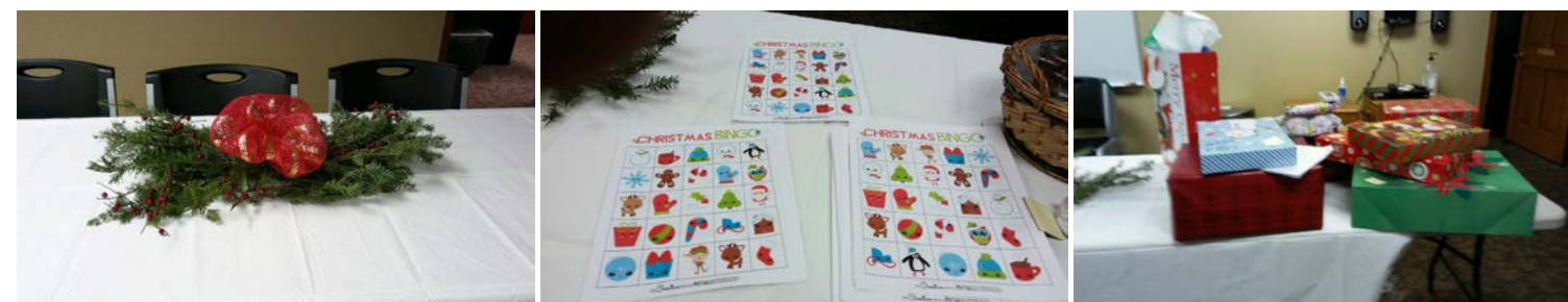
Pictured above: The St. Joseph chapter celebrated Christmas with games, food and donated gifts for two people.

We will be spending most of January and February gearing up for some spring sessions at our local libraries to speak on inclusion and disability awareness. We will also be setting up our life skills goals, guest speakers, and working towards the People First conference this spring.