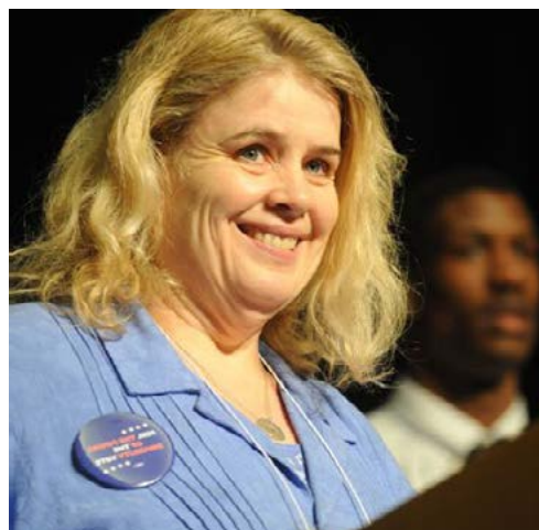
People First of Missouri