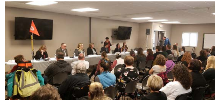
Photo, above: Boone County chapter hosts Disability Issues Candidate Forum.