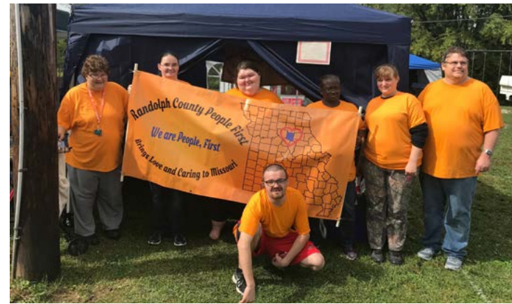
Photo, above: Randolph County chapter participates in Moberly's Homecoming Parade.

In September we participated in Moberly's Homecoming Parade. We showcased our new People First banner and posters. On October 6 we participated in a bake sale at the Higbee Fair. While at the fair we joined in on the parade. We plan to distribute treat bags on Halloween at the Trick or Treat trail.