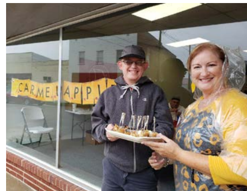
Photo, above: Pike county chapter provides caramel apples at Heritage Day Festival.

On September 8th, members set up a Caramel Apple Stand at the local Heritage Day Festival. It was a rain-filled day, but thanks to our friends, The Little Explorers, we stayed dry in their building! Some braved the rain to hand out samples!